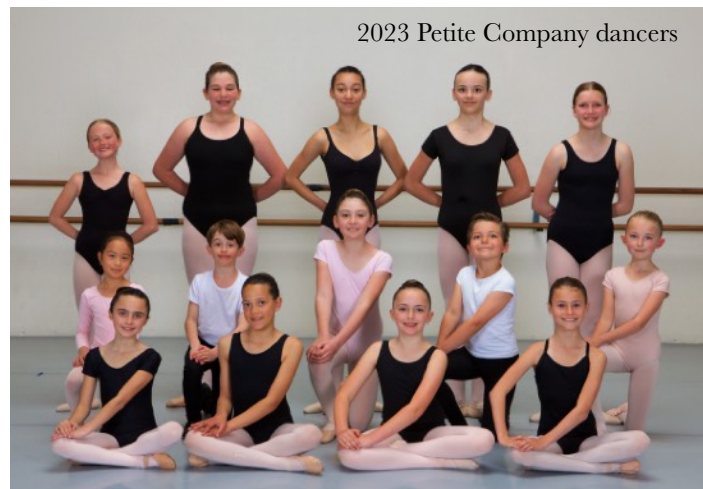
2023 Petite Company dancers